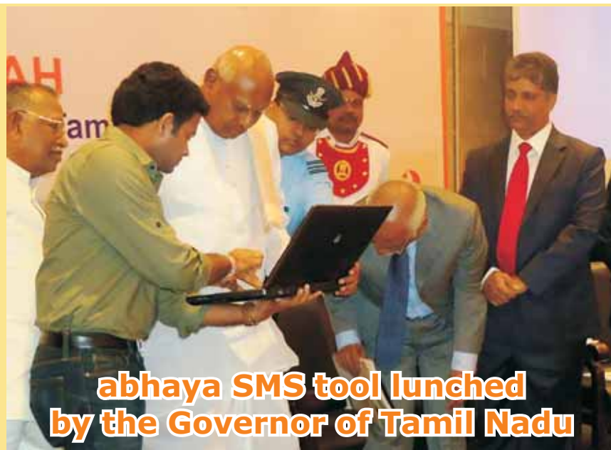
abhaya SMS tool launched by the Governor of Tamil Nadu