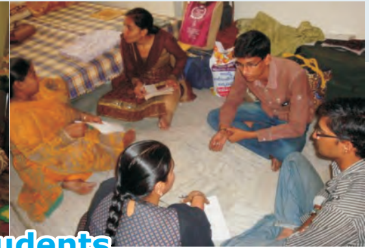
abhaya-Educare Volunteers interacting with students

If I could have met you during my school or college days. I am sure I may have learnt so many things from you. I have to learnt lot of things in associating myself with abhaya. The patience, inter personnel skills, communication skills, drafting mails so on. I want to develop myself in a right way. I want to improve my communication skills and how to do that. How to talk to professional people.